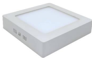
12W Surface Mounted LED Panel Light [Color: Daylight]

5.5.1 Install all new lighting fixtures as specified or at locations shown in plans or as directed by the Engineer/Architect.