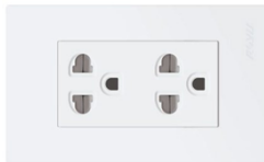
Duplex Universal Convenience Outlet