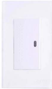
One Gang Switch with LED