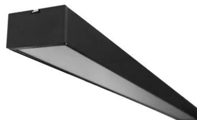
36W Linear LED Pendant Light [Color: Daylight, Black Housing]