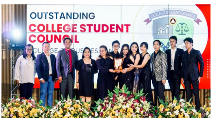
SAS honors outstanding student leaders, orgs, pubs