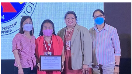
CHEDRO 3 recognizes TSU for transparency, accountability in financial transactions