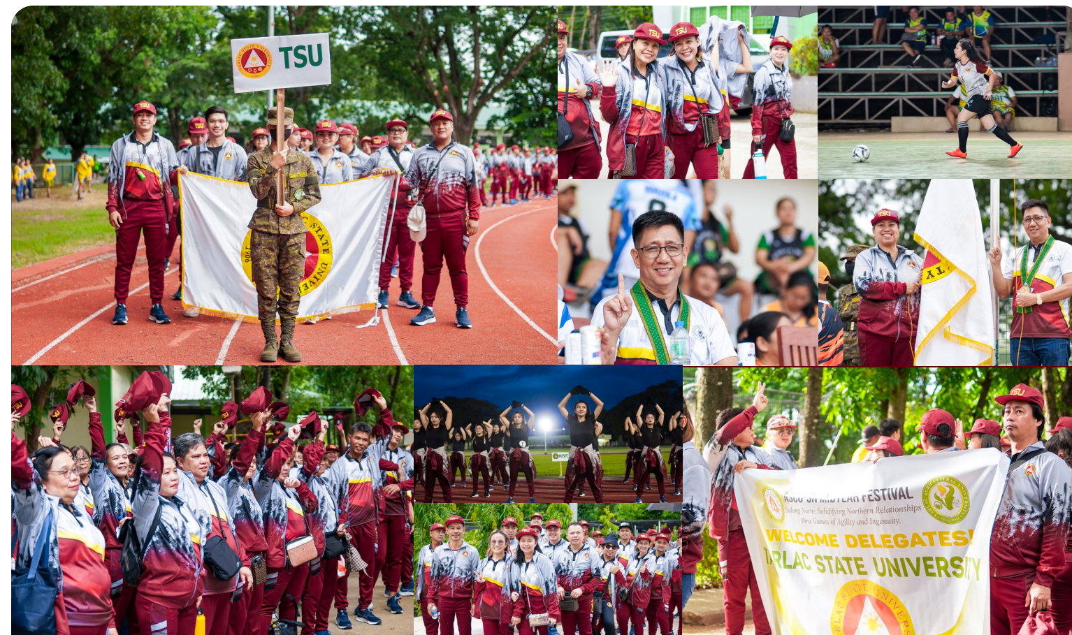
Association of State Colleges and Universities-Solid North (ASCU-SN) Midyear Festival June 26-29, 2023 | Tarlac Agricultural University (Host SUC)